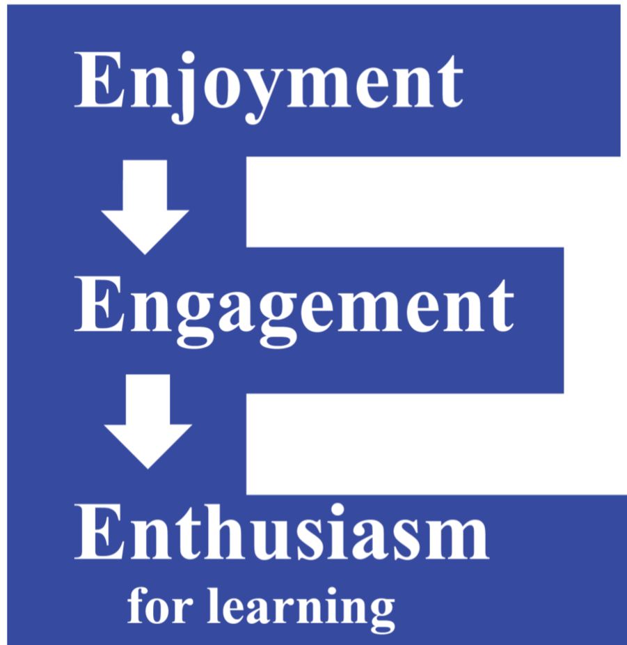
Figure 1. The three Es.

nor recommend “throwing out” basic curriculum, current practices, programs, or projects if they are currently producing positive results in both achievement and joyful learning. Rather, the SEM strikes a balance between traditional approaches to learning and approaches that promote thinking skills, hands-on learning, and creative productivity on the parts of all students. Our goals are to minimize boredom and “school turn-offs” and to improve achievement and creative productivity by infusing what we call the Three Es (Enjoyment, Engagement, and Enthusiasm for Learning, see Figure 1) into the culture and atmosphere of a school. We can do this by placing an easy-to-use teaching strategy into the tool bags of teachers.